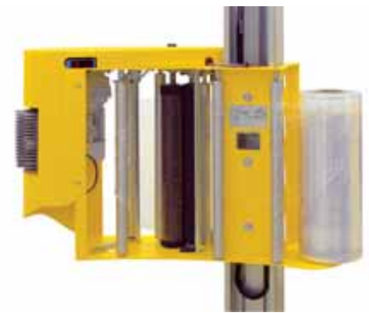
The Power Pre Stretch carriage is driven by belt lift and pre stretch wheels are easy to remove and change.